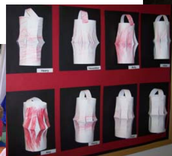
Chinese lanterns by Early Years Rooms