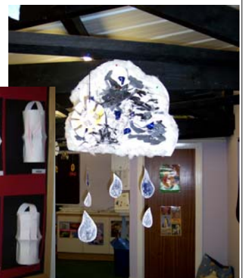
Clouds by Baby & Toddler Rooms