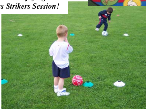
Children enjoying a Silks Strikers Session!